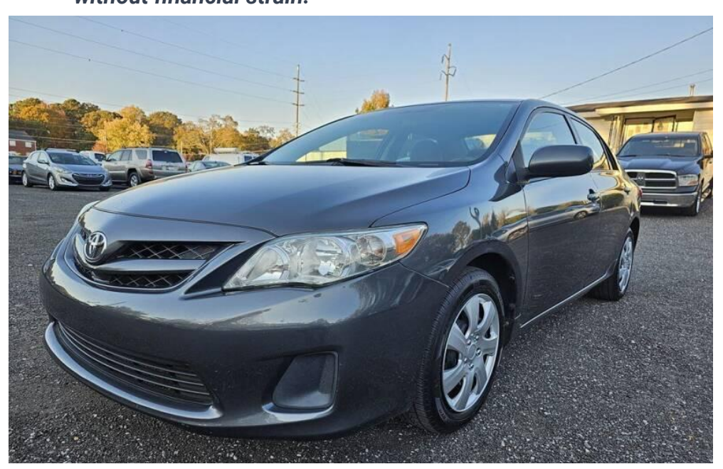
2021 Tesla Model 3 - Advanced Technology Windshield Replacement