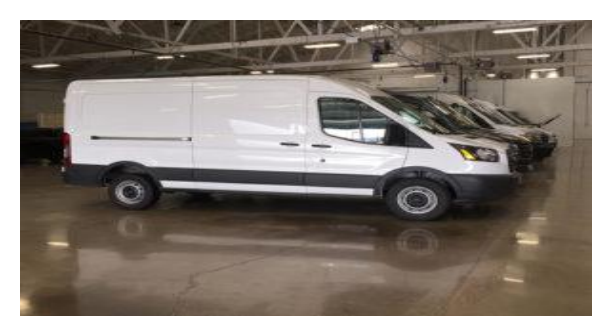
that You Need Auto Glass Repair

It's essential to be aware of the signs that indicate the need for auto glass repair. These signs include chips, cracks, or any damage that obstructs your vision or compromises the structural integrity of the glass.